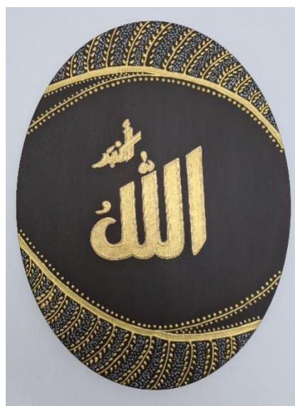
Allahu Akbar Mixed media on canvas, 40 cm (oval) 2021