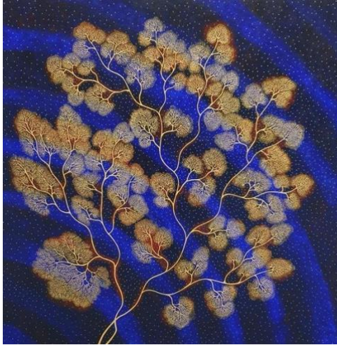
Be Like A Tree! Mixed media on canvas, 150 x 150 cm 2019