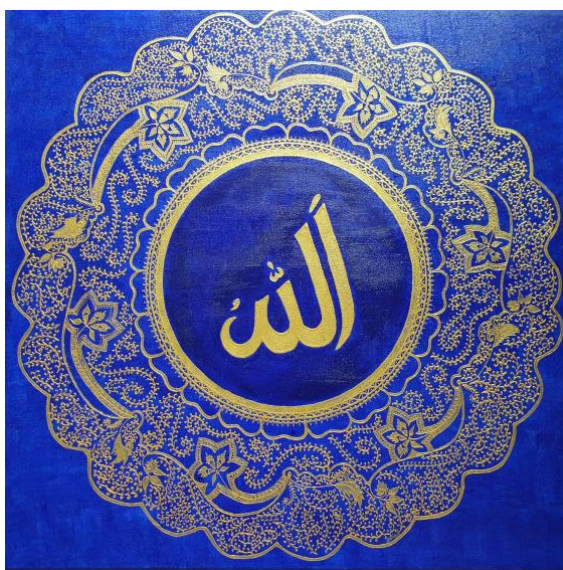
Allah Mixed media on canvas 90 x 90 cm 2019