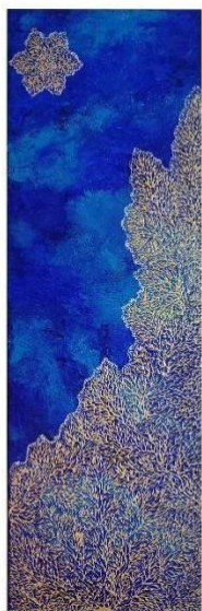
Aqua Wonderland Mixed media on canvas, 90 x 30 cm 2023