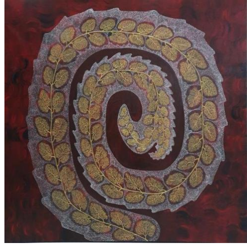
Deep Within! Mixed media on canvas, 180 x 180 cm 2019