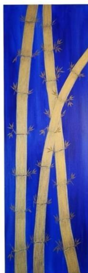
Lucky Bamboos 3 Mixed media on canvas 61 x 20 cm 2023