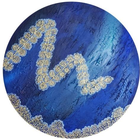
Coral Kaleidoscope 5 Mixed media on canvas 40 cm (circle) 2023