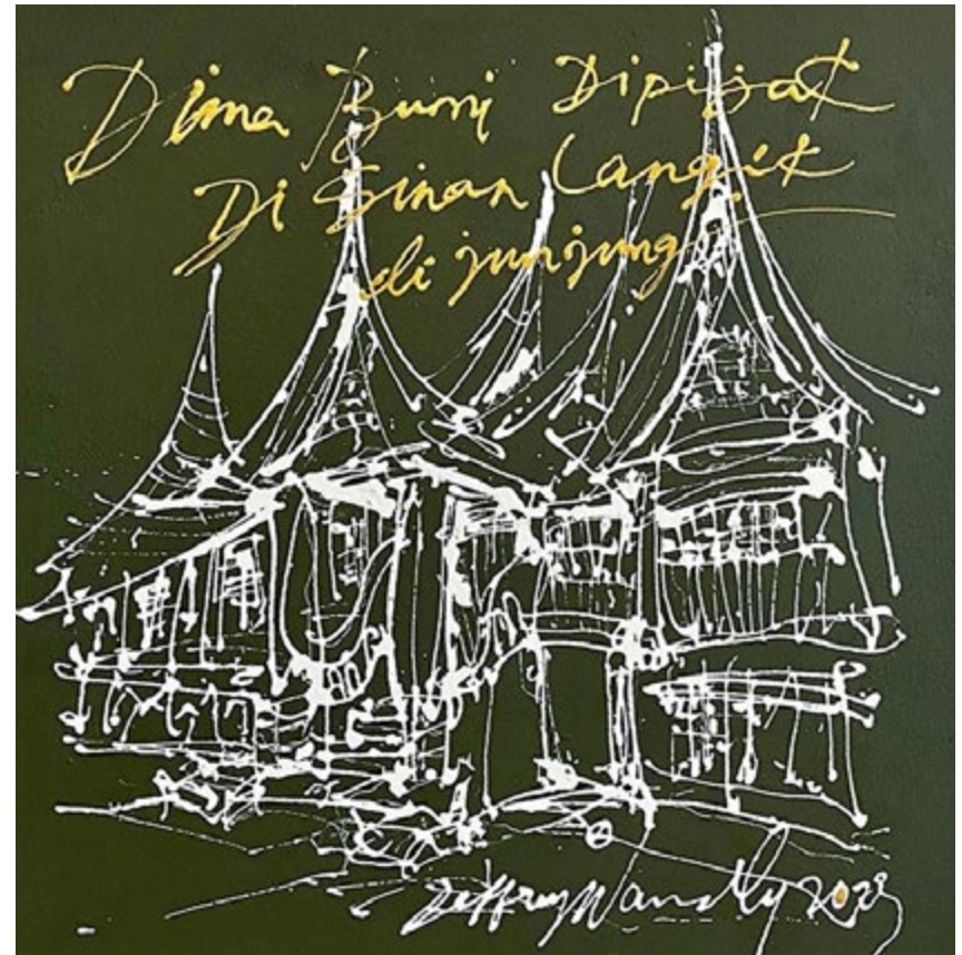
Minangkabau Wisdom I 2023 Dima bumi dipijak, disinan langik dijunjung Acrylic on canvas, 80 x 80 cm

In Minangkabau Wisdom I – "Dima bumi dipijak, disinan langik dijunjung" (where the feet touch the ground, where the sky is held up), we are advised to follow traditions or laws, according to the place that we live in or stay. In Minangkabau Wisdom II – "Alam takambang dijadikan guru," (nature is a teacher), there are many life lessons that we can learn from nature, such as always being humble, never give up, and more. These lessons are learned by observing the natural surroundings and not destroying our environment so we can always learn from it."