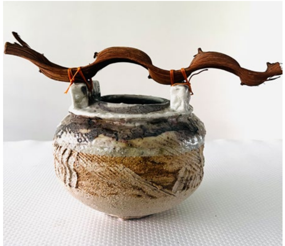
White Vessel with Branch 2020 Stoneware H17 (with branch) x 16 x 16.5 cm