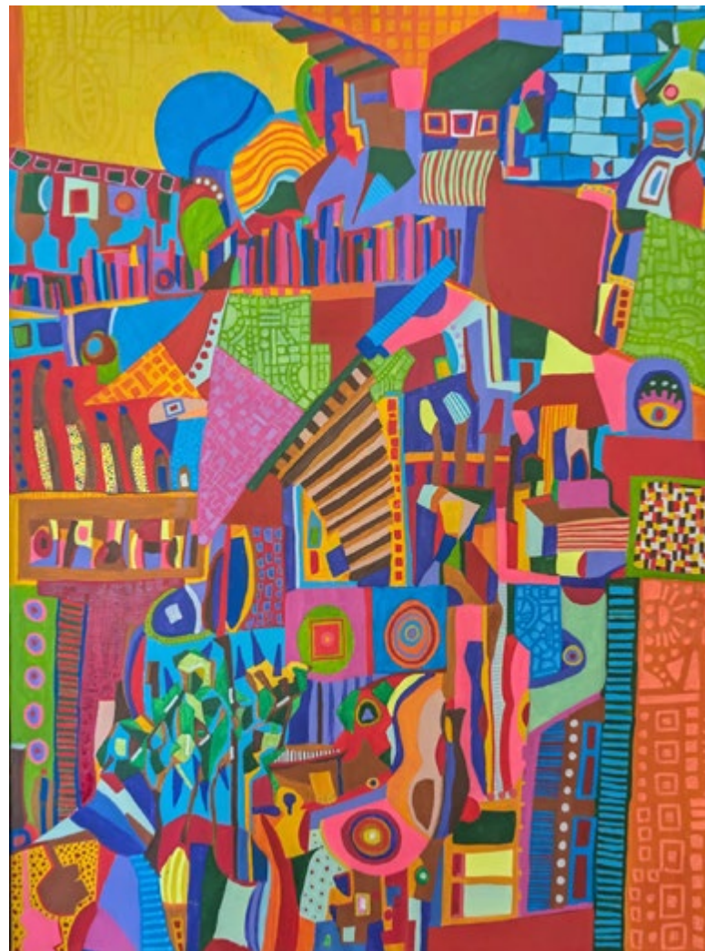
My Everyday Color Story 2024 Acrylic, ink on canvas, 50 x 70 cm

Holidays are for letting loose, and that goes for my mind too! It's like a giant playground where I can explore and imagine all sorts of things. No schedules, no plans, just pure, unadulterated fun. The pieces capture the magic of seeing the world from a tiny tot's perspective. Everything becomes an adventure, from the dancing dust to the strum of a guitar, and a record player becomes a portal to fantastical adventures with shimmering rainbows splattering around. It's a peek into a world brimming with curiosity and wonder, where anything and everything is possible!"