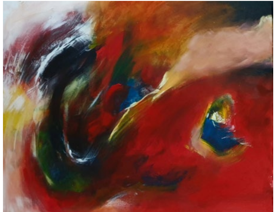
Play time 2022 Acrylic on canvas, 60 x 80 cm

“The process of inner self into the creation of movement and form of expression demand a high degree of discipline, self-criticism and a singular dedication. In discovering conceptual expression through the forms and colors, it helps expand my horizons and develops the spirit of confidence, creativity and devotion that provides for mutual harmony between myself and the environment within. Processes and acts of realization are linked into the expressions of movement which develop into a kind of mystery through this zone. I hope to explore further making something into an experience of a total creation.”