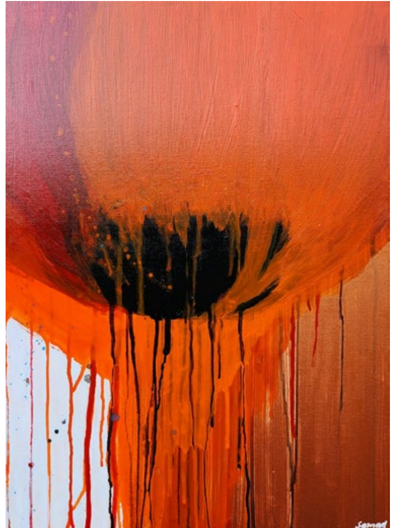
Black Lily 1 2024 Acrylic on canvas, 46 x 61 cm