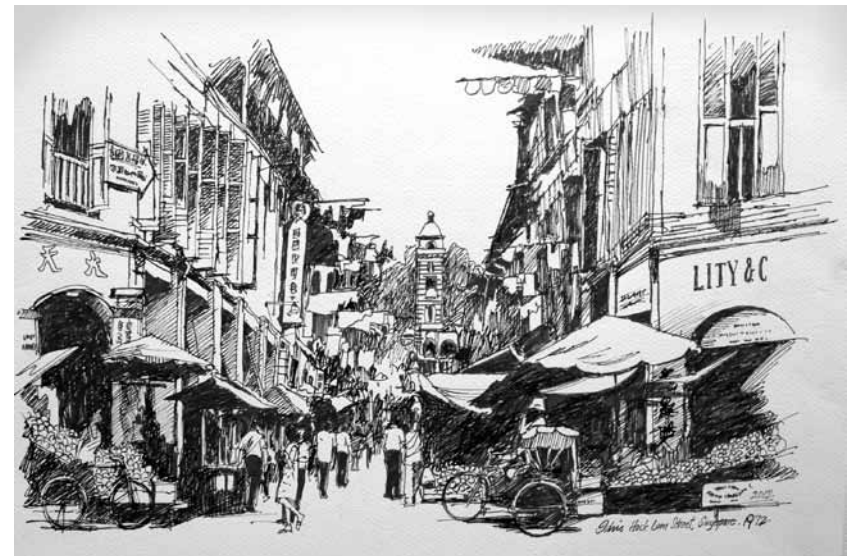
Idris Ali 'HOCK LAM STREET, 1972', Pen & ink, 760 x 560 mm, 2012

'DEMI TECHNOLOGI' (TECHNOLOGY'S SAKE) Oil on canvas 1200 x 1000 mm 2012