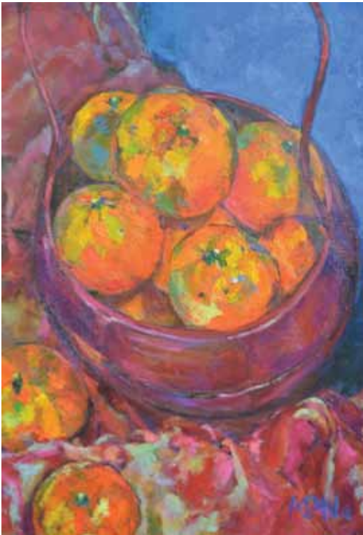
Alec Tan 'SILVER RIVER, GOLD MOUNTAIN' Oil on canvas, 900 x 710 mm, 2013