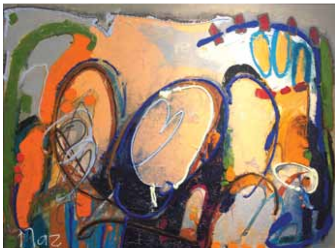
Naz Kaya 'NOTHING SCARES ME!', Mixed media, 900 X 1200 mm, 2012

'INDIAN WOMAN' Oil on canvas 720 x 1220 mm