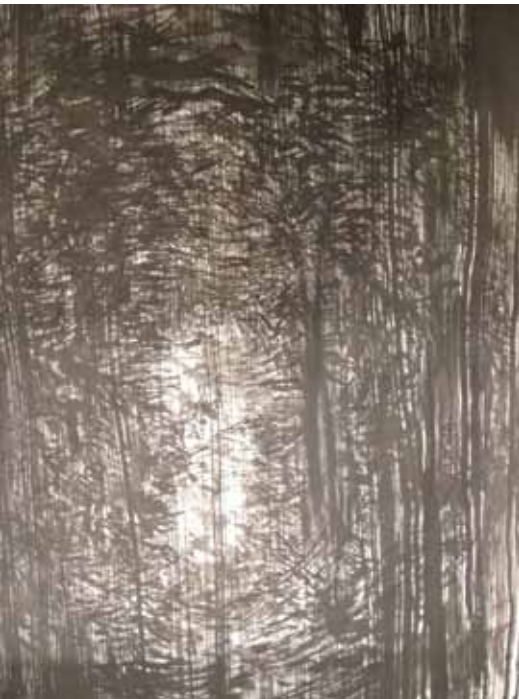
Amanda Soon 'ABYSS', Chinese ink on Indian cotton rag paper, 590 x 420 mm, 2012