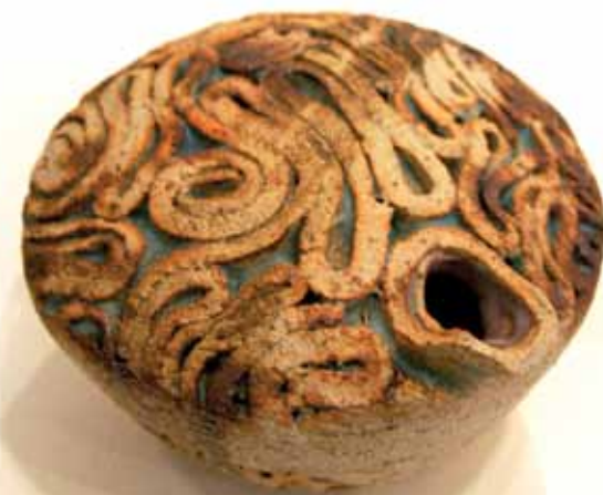
Aida Khalid 'BEKAS', Raku clay, 380 X 80 mm, 2012