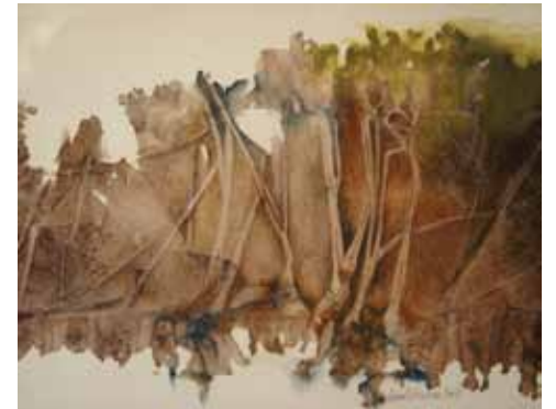
'TRACES' (Triptych) Watercolour & pigment on paper 220 x 230 mm (x 2) 240 x 280 mm 2012