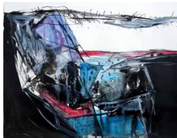
Putu Bonuz 'ATRAKSI GARIS V1' (LINE OF ATTRACTION) Mixed media, 500 X 850 mm, 2013