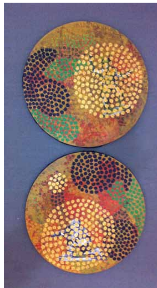
Adi Yadoni 'SILENCE PART #3', Mixed media, 500 mm in diameter, 2012