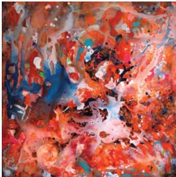
Deusa Blumke 'LITTLE DANCER' Mixed media on plexiglas, 1000 x 1000 mm, 2013