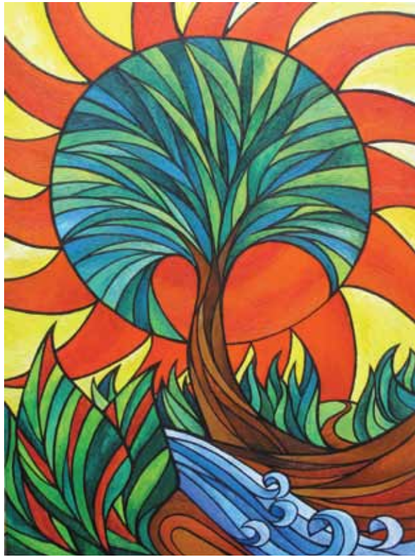
Christine Das 'SUN BLAST', Acrylic on canvas 1200 x 760 mm, 2011