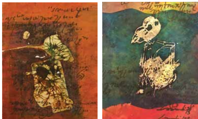
Tumadi Patri 'WAYANG' Series, Batik, 190 x 240 mm, 2011

Warm glass technique, Fused glass with wire, 500 x 250 mm, 2013