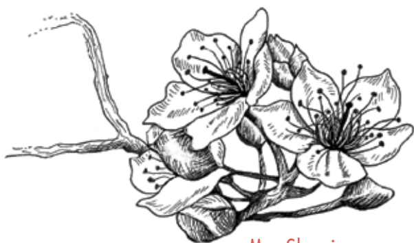
Mas Shaari 'CHERRY BLOSSOM' Pen & ink, 300 x 200 mm, 2006 (for 'Japanese Foods That Heal', Periplus, 2006)