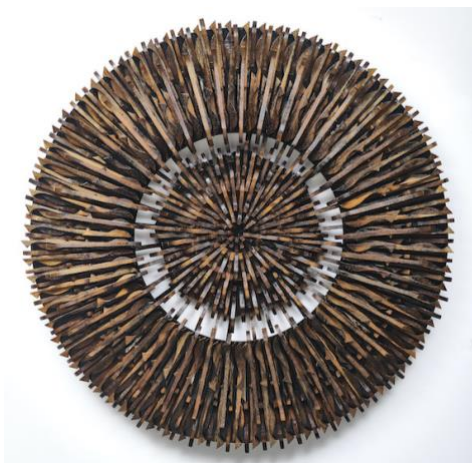
Mohd Fairuz Paison (Po Oi) Rounded Mind – Bulat Berpinau Discarded wood relief assemblages 122 x 122 cm, 2021