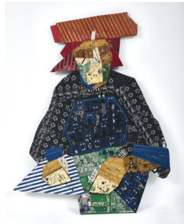
Nor Tijan Firdaus After The Samsui Worker by Lai Foong Moi E-Waste on wood panel coated with 2k matte resin 110 x 88 cm, 2021