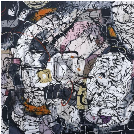
Husin Othman Waiting for New Rays II Acrylic on canvas 75 x 75 cm, 2021