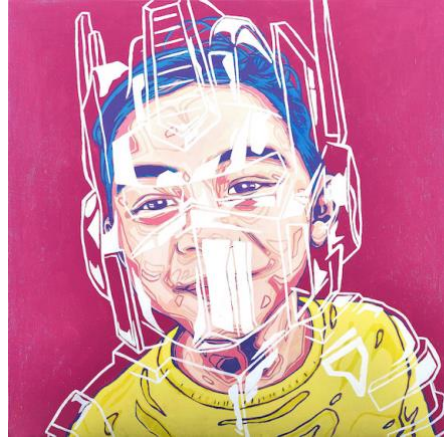
Syafiq Hariz Mugunghwakkochi Pieotseumnida I Acrylic and oil on canvas 85 x 85 cm, 2021