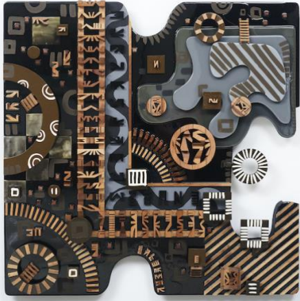
Anniketyni Madian NGENAWASKA #1 Mixed wood, metal, epoxy resin, linseed boiled oil 103 x 103 cm, 2021