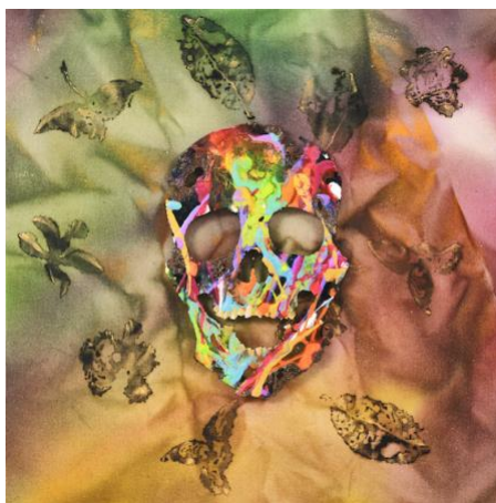
Haafiz Shahimi The Martyr I Rusted chemical wash, acrylic, automotive paint, metal plate (plasma cutting), pyrography print, remazol on jute and finished with 2K gloss paint 61 x 61 cm, 2021