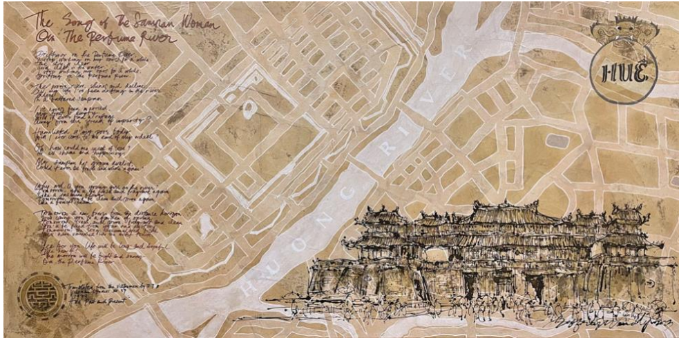
Jeffrey Wandly Huong River, Hue Imperial City / Sông Hương - Cố đô Huế, 2023 Ink and acrylic, Vietnamese Dó Paper / Mực và acrylic trên giấy dó, 240 x 120 cm