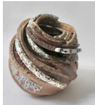
Hiroko Mita EMBRACE II (Line Series) ÔM TRỌN II (Loạt tác phẩm "Line"), 2023 Mixed clay / Đất sét tổng hợp, 20 x 25 x 18 cm