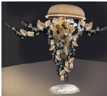
Phạm Thủy Tiên Câu Chuyện của Nước / The Story of Water, 2023 Sắp đặt với thuyền thúng, giấy dó, cát, lưới, chỉ câu / Installation with basket boat, Vietnamese Dó Paper, sand, net, fishing line, 400 x 400 x 500 cm